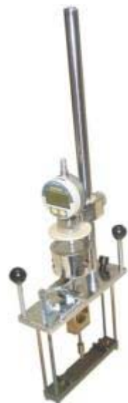
Close view of single station