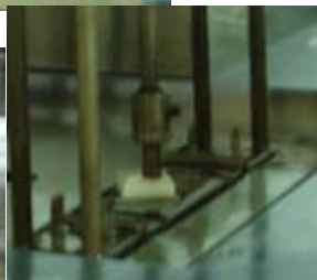
Loading nose for HDT