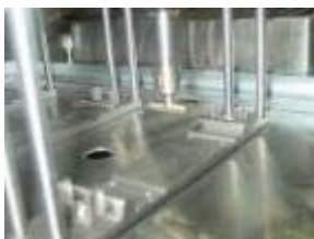
Needle for VICAT

Perform HDT and VICAT in the same station. Only change loading nose for HDT test, and needle for VICAT test.